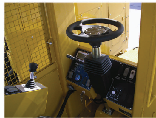
An Inside Insight To The H7's Cab